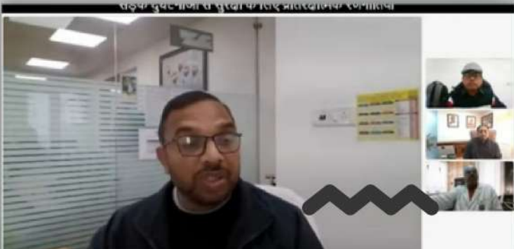
Mitigating Strategies against Road Accidents & its Consequences to achieve Road Safety